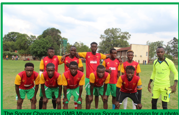
The Soccer Champions GMB Mhangura Soccer team posing for a photo before their final match