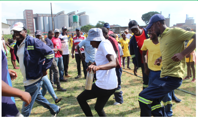
Supporters enjoying at the sports tournament held at Aspindale recently.