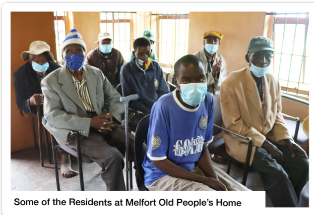
Some of the Residents at Melfort Old People's Home