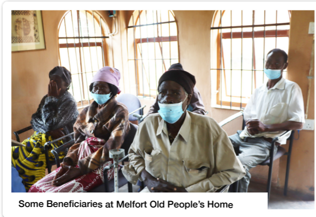
Some Beneficiaries at Melfort Old People's Home